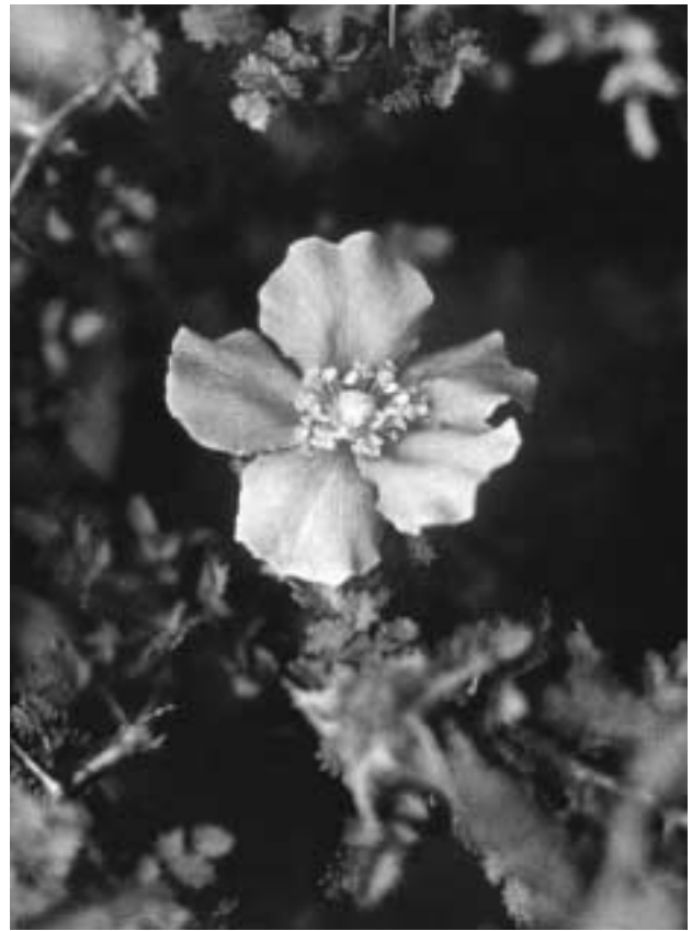
Previously included in the genus Hemizonia , the Southern tarplant ( Centromadia parryi ssp. australis ), left, is a CNPS List 1B plant from mesic areas in southern California. Its habitat has been heavily fragmented by urbanization and many populations have been extirpated. • Small-leaved rose ( Rosa minutifolia ), right, is state-listed as Endangered, and is known in California from only one occurrence on Otay Mesa in San Diego County. Despite its listing status, the population was transplanted in 1997 as mitigation for a development project.

The analysis of impacts in a Neg Dec is based on the Initial Study (IS). A Neg Dec does not have to be as exhaustive in its analysis of impacts as an EIR, but it should be well documented. If the IS includes only a checklist without additional text explaining the responses (including the “No” responses), or at least referencing other documents or maps, then it is not complete .