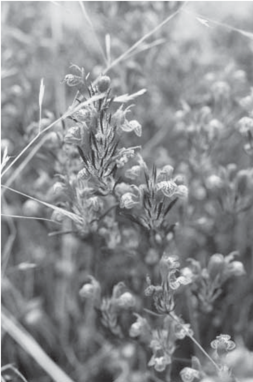
San Diego mesa mint ( Pogogyne abramsii ) is restricted to vernal pool areas in northern San Diego County. It is state- and federally-listed as Endangered, and is seriously threatened by urbanization, trash dumping, and off-road vehicles on San Diego mesas.

commission will forward a recommendation as to whether or not to certify the EIR to the board of supervisors or the city council. The supervisors or the council certify the EIR at another public hearing.